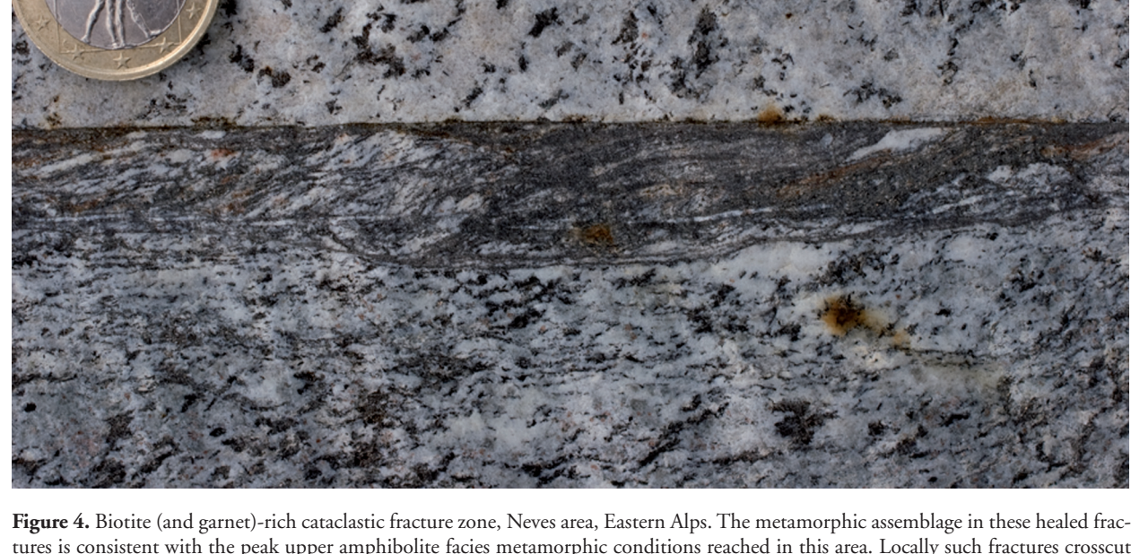
Figure 4. Biotite (and garnet)-rich cataclastic fracture zone, Neves area, Eastern Alps. The metamorphic assemblage in these healed fractures is consistent with the peak upper amphibolite facies metamorphic conditions reached in this area. Locally such fractures crosscut amphibolite-facies ductile shear zones (e.g. Fig. 1), indicating that at least some such fractures developed under upper amphibolite facies conditions. One euro coin for scale.

In the typical simple model of lithospheric deformation, brittle fracture is limited to the upper crust although, for low geothermal gradients, the upper part of the lithospheric mantle could also be brittle (e.g. Ranalli and Murphy, 1987). However, in nature local brittle fracture clearly occurs even under upper amphi-