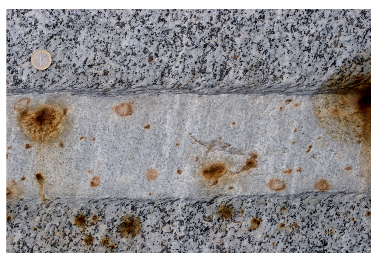
Figure 2. Localization of shearing on the rim of an aplite dyke in granodiorite, Neves area, Eastern Alps. One euro coin for scale.

it has a higher effective viscosity) than the surrounding granodiorite. Localization of shear on the boundaries is only observed when the layer is stronger than the matrix. Less competent basic dykes (lamprophyres) from the same area show a higher and quite homogeneous shear strain within the dyke itself and a discrete transition across the boundary to low strain in the adjacent granodiorite, without any flanking ductile shear zone (Pennacchioni and Mancktelow, 2007).