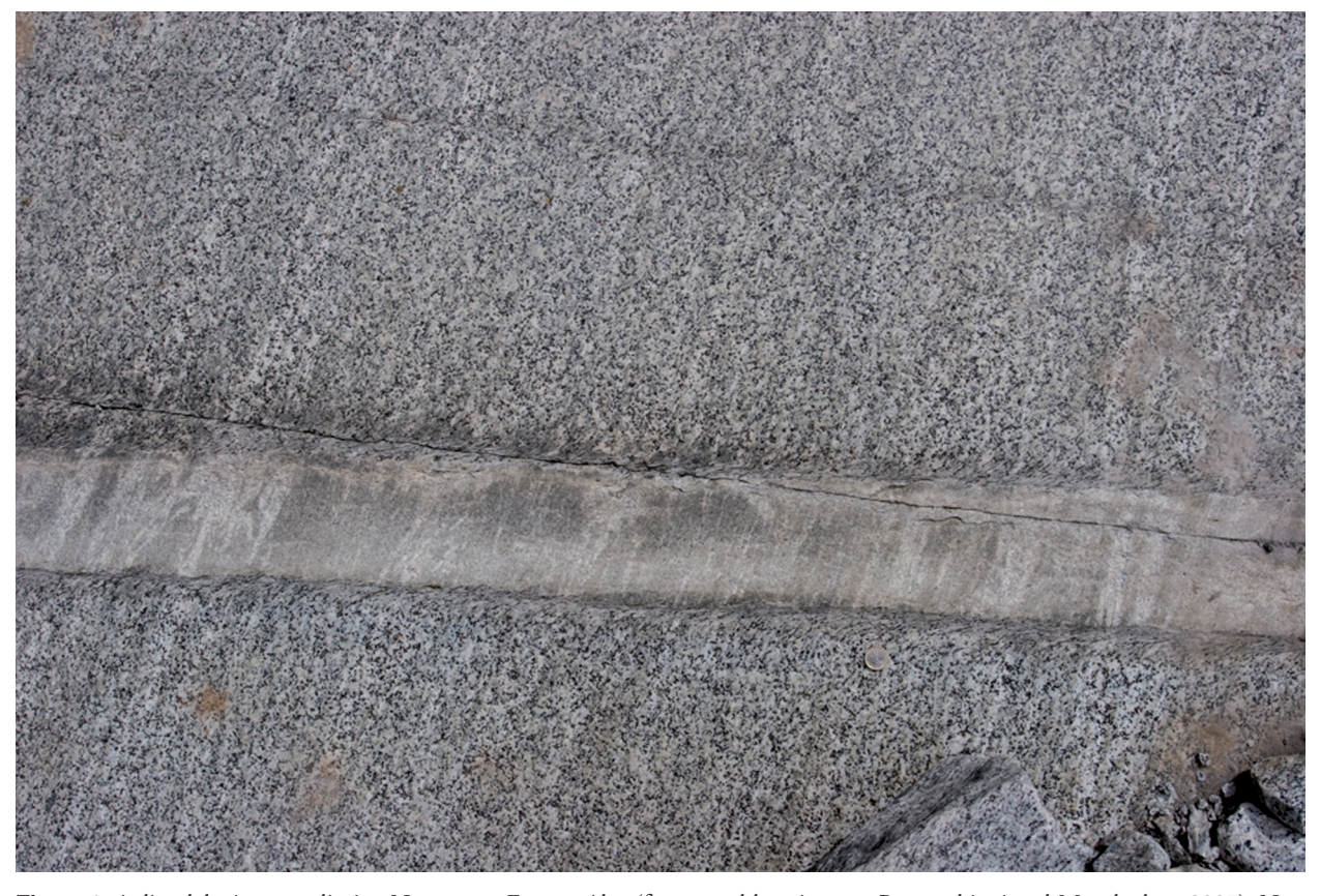
Figure 1. Aplite dyke in granodiorite, Neves area, Eastern Alps (for general location, see Pennacchioni and Mancktelow, 2007). Note the localization of ductile shearing on the rim of the dyke and the discrete fracture crosscutting the dyke boundary at a low angle. One euro coin for scale, width of dyke ca. 15 cm.

The elastic properties, angle of internal friction and cohesion of a wide variety of rocks are rather similar,