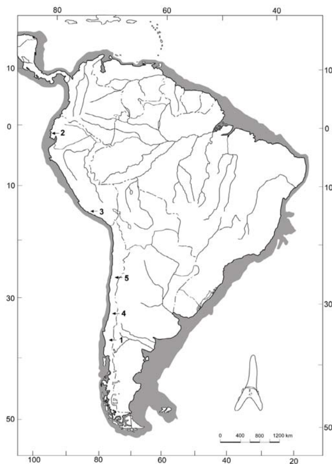
FIG. 2. Localities with fossil odontaspids in the Pacific coast of South America. 1. Lebu (Chile); 2. Punta La Colorada and Punta La Gorda (Ecuador); 3. Sacaco (Perú); 4. Navidad (Chile); 5. Bahía Inglesa (Chile). The present South American continental shelf is in gray.