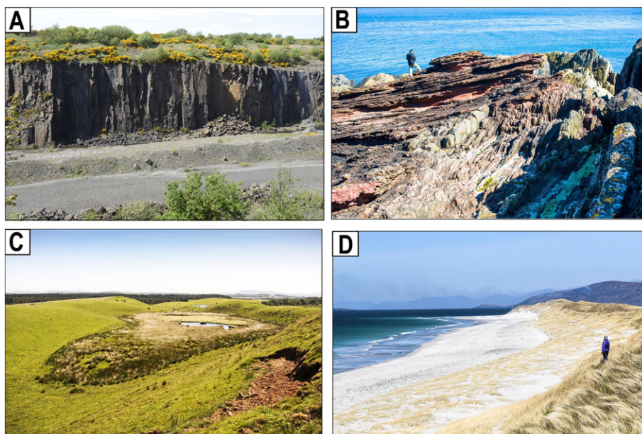
Fig. 1. A. Extensive exposures of a Permo-Carboniferous quartz-dolerite sill in a disused quarry. B. Siccar Point, Scotland, is a unique exposure of very limited extent, where James Hutton in 1788 demonstrated an immense gap in geological time represented by the unconformity between the steeply dipping Silurian greywacke sandstones and the overlying and gently dipping Devonian red sandstones. C. Esker landforms formed by Pleistocene glacial meltwaters. These ridges of sand and gravel are relict features and are vulnerable to damage and destruction from mineral extraction. D. Coastal beach and sand dune system evolving naturally through active movement and interchange of sand between the nearshore, foreshore, beach and dune areas.

Management objectives should be tailored appropriately for different types of interest and categories of geoconservation site, recognising their different requirements. For example, in Great Britain, generic objectives are based on a tripartite classification of sites, which may occur as natural and man-made exposures, landforms or active geomorphological systems (Prosser et al., 2018; Prosser, Murphy, & Larwood, 2006). Where there is a substantial reserve of rock or sediment, and the interest is not localised, the main conservation principle is that removal of material does not necessarily damage the resource as new exposures of the same type will be freshly exposed (Fig. 1A). Sites where the interest is localised or finite (e.g. geological type sites, occurrences of Quaternary interglacial deposits or fossil-bearing horizons) (Fig. 1B) require careful management to protect the resource from depletion or loss of material. Geomorphological sites include both static (inactive) features (e.g. Pleistocene glacial landforms) and active features (e.g. coastal and river landforms), and damage to one part of a site is likely to be detrimental to the value of