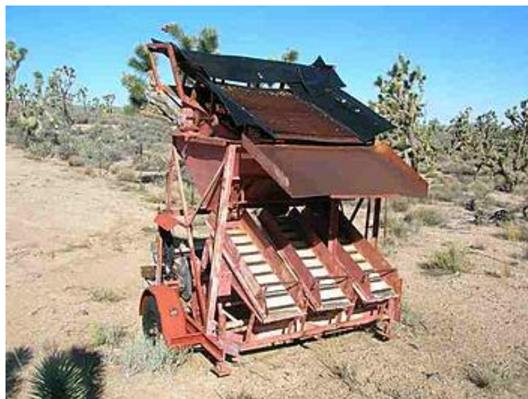
Figure 2. Dry washers.

Dry washer is made up of a frame that a heavy and well-braced screen is enclosed with burlap overlain with fly screen and/or window while being enclosed with fine linen. Figure 2 shows a typical dry washer. A power dry washer is