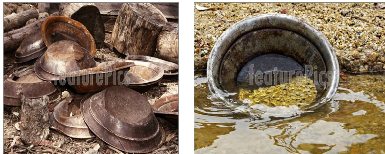
Figure 1. Gold pans.

Gold pans are applied in cleaning gold-bearing concentrates, gold prospecting, as well as hand working of isolated and rich deposits even though rarely. Hence, at the bottom of the gold pans heavy minerals are concentrated while at the top is where the lighter materials are removed to ensure that the basic operation of gold panning is simple. However, skills and experience are required to