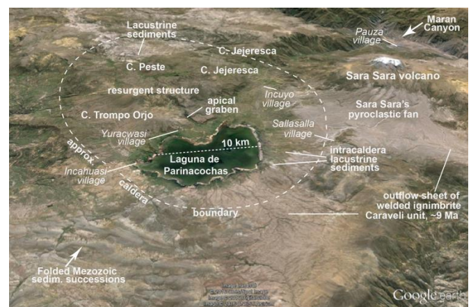
Figure 1. Oblique Google Earth view from the SW of the Incahuasi caldera system. The North is toward the upper-left corner of the image. The caldera boundary (visible and inferred) is indicated with a dashed line. The dendritic drainage south of Laguna de Parinacochas is cut within the welded outflow sheet of the ca. 9 Ma Caraveli ignimbrite unit.

We interpret these topographic and structural features around Laguna de Parinacochas as the southern part of a larger caldera system. The western caldera rim is particularly well preserved with relatively steep-sided walls, while the gently inclined to sub-horizontal borders on the southern side recall a hinged line described at