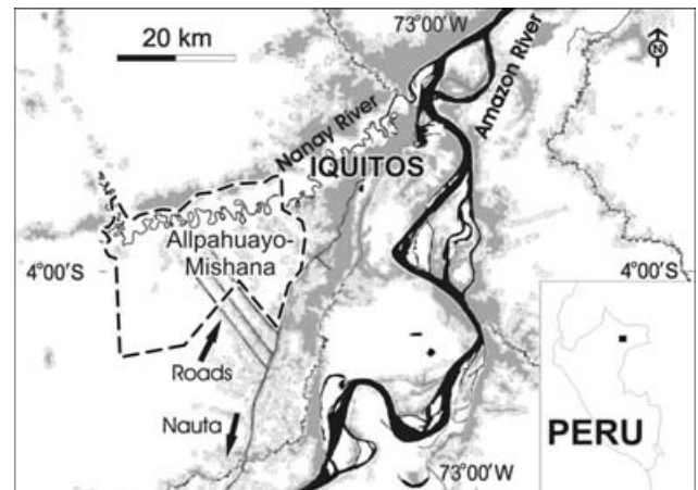
Figure 1 Map of the study site. Dashed line indicates the boundaries of the AMNR. The area shaded in grey indicates the current deforestation frontiers associated with road and river access.

Our study of the process and consequences of the establishment of the AMNR was initiated in 1999, soon after its establishment as a Reserved Zone (a provisional status given to a PA while its final category is being determined). Our main interests lay in the interface between the scientific base of the Reserve's creation and the public debate that the