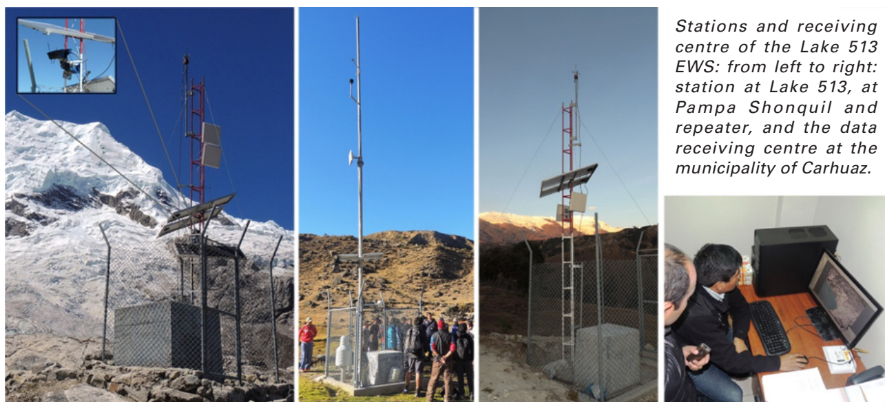
Stations and receiving centre of the Lake 513 EWS: from left to right: station at Lake 513, at Pampa Shonquil and repeater, and the data receiving centre at the municipality of Carhuaz.

of Laguna 513, there are large daily temperature fluctuations, long periods of cloudiness, heavy precipitation and high solar radiation as well as a steep topography in what is a remote environment. All of these factors need to be considered in the design and implementation. The GLOF EWS adventurer/scientists had to make provisions for reduced energy, for complications with data transmission from the sensors and the limited access for sensor installation and frequent following-up and maintenance.